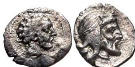
234, Lot: 112. Closing Jun 09, 2010 at 10:37:20 a.m. ET. CILICIA, Uncertain. 4th century BC. AR Obol (10mm, 0.56 g, 3h).

BID Estimate $100 Current Bid: $62 Bidders (2)