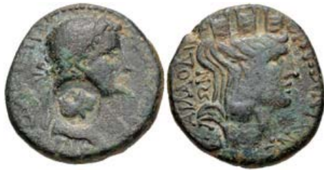
234, Lot: 165. Closing Jun 09, 2010 at 10:55:00 a.m. ET. SYRIA, Seleucid and Pieria. Laodicea ad Mare. Gaius (Caligula). AD 37-41. Æ (22mm, 9.90 g, 12h).

BID Estimate $100 Current Bid: No Bids Bidders (0)