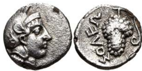
234, Lot: 98. Closing Jun 09, 2010 at 10:32:40 a.m. ET. CILICIA, Soloi. 4th century BC. AR Obol (9mm, 0.67 g, 8h).

BID Estimate $100 Current Bid: $60 Bidders (1)