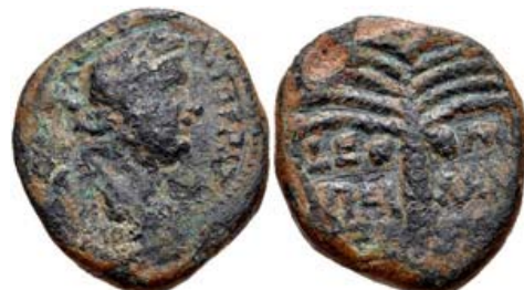
234, Lot: 174. Closing Jun 09, 2010 at 10:58:00 a.m. ET. SYRIA, Decapolis. Pella.