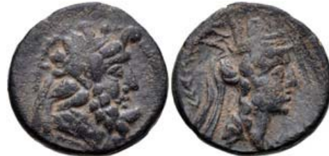
234, Lot: 124. Closing Jun 09, 2010 at 10:41:20 a.m. ET. SYRIA, Uncertain. Circa 1st century BC. AE (18mm, 5.96 g, 12h).

BID Estimate $200 Current Bid: $215 Bidders (4)