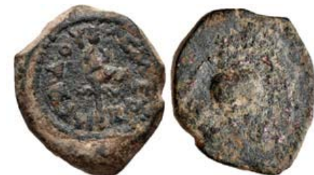
234, Lot: 128. Closing Jun 09, 2010 at 10:42:40 a.m. ET. JUDAEA, Herodians. Herod I (the Great). 40-4 BCE. AE 2 Prutot (174mm, 4.72 g, 12h). Samaria mint.

BID Estimate $300 Current Bid: No Bids Bidders (0)