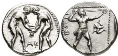
234, Lot: 91. Closing Jun 09, 2010 at 10:30:20 a.m. ET. PAMPHYLIA, Aspendos. Circa 380/75-330/25 BC. AR Stater (22mm, 10.91 g, 12h).

BID Estimate $200 Current Bid: $120 Bidders (1)