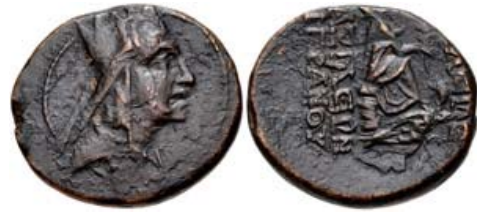
234, Lot: 118. Closing Jun 09, 2010 at 10:39:20 a.m. ET. KINGS of ARMENIA. Tigranes II 'the Great'. 95-56 BC. AE Chalkous (22mm, 7.27 g, 12h). Uncertain Armenian mint. Struck 70-66 BC.

BID Estimate $100 Current Bid: $115 Bidders (2)