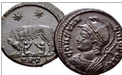
234, Lot: 612. Closing Jun 09, 2010 at 1:24:00 p.m. ET. ROMAN. Imperial. Lot of two (2) 4th century A Commemorative Folles.

BID Estimate $200 Current Bid: $140 Bidders (3)