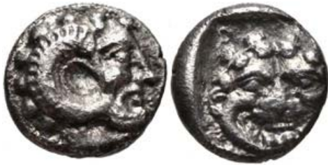
234, Lot: 95. Closing Jun 09, 2010 at 10:31:40 a.m. ET. CILICIA, Mallos. 4th century BC. AR Obol (8mm, 0.70 g, 4h).

BID Estimate $100 Current Bid: $62 Bidders (2)