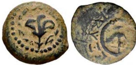
234, Lot: 125. Closing Jun 09, 2010 at 10:41:40 a.m. ET. JUDAEA, Hasmoneans. Alexander Jannaeus. 103-76 BCE. AE Prutah (13mm, 1.54 g, 10h). Jerusalem mint.

BID Estimate $100 Current Bid: No Bids Bidders (0)