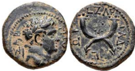
234, Lot: 169. Closing Jun 09, 2010 at 10:56:20 a.m. ET. SYRIA, Decapolis. Gadara. Titus. AD 79-81. Æ (17mm, 5.35 g, 12h). Dated CY 137 (AD 73/4).

BID Estimate $100 Current Bid: No Bids Bidders (0)