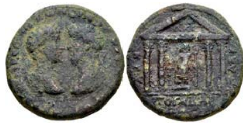
234, Lot: 170. Closing Jun 09, 2010 at 10:56:40 a.m. ET. SYRIA, Decapolis. Gadara. Marcus Aurelius & Lucius Verus. AD 161-169. Æ (30mm, 23.21 g, 12h). Dated CY 226 (AD 160/1).

BID Estimate $100 Current Bid: No Bids Bidders (0)