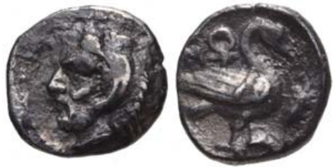
234, Lot: 97. Closing Jun 09, 2010 at 10:32:20 a.m. ET. CILICIA, Mallos. Circa 385-333 BC. AR Obol (9mm, 0.74 g, 10h).

BID Estimate $100 Current Bid: $60 Bidders (1)