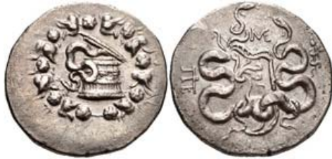
234, Lot: 83. Closing Jun 09, 2010 at 10:27:40 a.m. ET. MYSIA, Pergamon. Circa 166-67 BC. AR Tetradrachm (27mm, 12.49 g, 12h). Cistophoric type. Struck 123-104 BC.

BID Estimate $150 Current Bid: $140 Bidders (5)