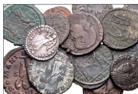
234, Lot: 611. Closing Jun 09, 2010 at 1:23:40 p.m. ET. ROMAN. Imperial. Lot of forty-six (46) AR and A denominations of the 4th century.

BID Estimate $150 Current Bid: No Bids Bidders (0)