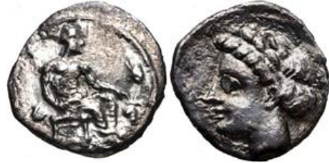
234, Lot: 114. Closing Jun 09, 2010 at 10:38:00 a.m. ET. CILICIA, Uncertain. 4th century BC. AR Obol (11mm, 0.71 g, 6h).

BID Estimate $100 Current Bid: $60 Bidders (1)