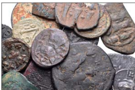
234, Lot: 614. Closing Jun 09, 2010 at 1:24:40 p.m. ET. BYZANTINE and ARAB-BYZANTINE. Miscellaneous. Lot of seventeen (17) mixed A denominations.

BID Estimate $200 Current Bid: No Bids Bidders (0)