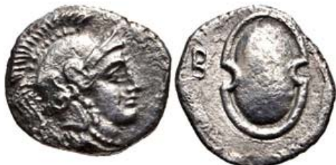
234, Lot: 107. Closing Jun 09, 2010 at 10:35:40 a.m. ET. CILICIA, Tarsos. Balakros. Satrap of Cilicia, 333-323 BC. AR Obol (10mm, 0.68 g, 10h).

BID Estimate $100 Current Bid: No Bids Bidders (0)