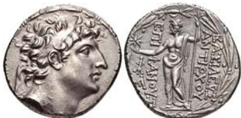
234, Lot: 121. Closing Jun 09, 2010 at 10:40:20 a.m. ET. SELEUKID KINGS of SYRIA. Antiochos VIII Epiphanes (Grypos). 121/0-97/6 BC. AR Tetradrachm (27mm, 16.31 g, 12h). Antioch mint. Struck circa 112-111/10 BC.

BID Estimate $100 Current Bid: $60 Bidders (1)