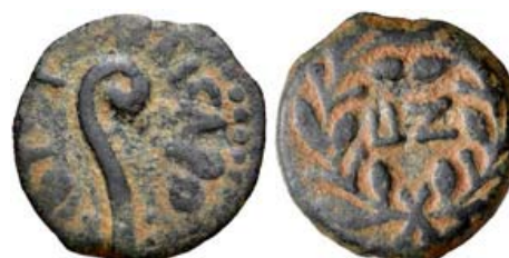
234, Lot: 132. Closing Jun 09, 2010 at 10:44:00 a.m. ET. JUDAEA, Procurators.