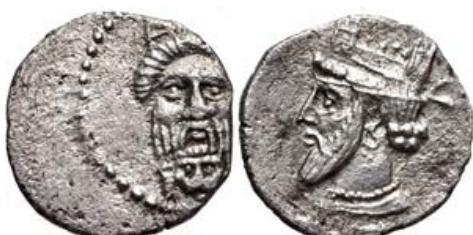
234, Lot: 111. Closing Jun 09, 2010 at 10:37:00 a.m. ET. CILICIA, Uncertain. 4th century BC. AR Obol (11mm, 0.64 g, 11h).

BID Estimate $100 Current Bid: $60 Bidders (1)