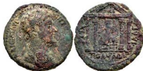
234, Lot: 172. Closing Jun 09, 2010 at 10:57:20 a.m. ET. SYRIA, Decapolis. Gadara. Marcus Aurelius. AD 161-180. Æ (29mm, 15.01 g, 12h). Dated CY 226 (AD 162/3).

BID Estimate $100 Current Bid: $60 Bidders (1)