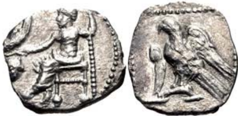
234, Lot: 115. Closing Jun 09, 2010 at 10:38:20 a.m. ET. CILICIA, Uncertain. 4th century BC. AR Obol (12mm, 0.64 g, 9h).

BID Estimate $100 Current Bid: $60 Bidders (1)