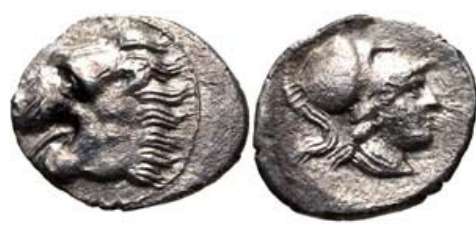
234, Lot: 92. Closing Jun 09, 2010 at 10:30:40 a.m. ET. PAMPHYLIA, Side. 4th century BC. AR Obol (12mm, 0.74 g, 1h).

BID Estimate $500 Current Bid: $320 Bidders (2)