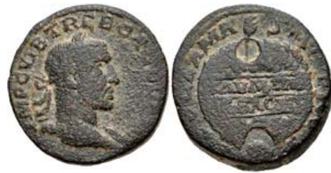
234, Lot: 166. Closing Jun 09, 2010 at 10:55:20 a.m. ET. SYRIA, Coele-Syria. Damascus. Trebonianus Gallus. AD 251-253. Æ (23mm, 11.26 g, 12h).

BID Estimate $100 Current Bid: No Bids Bidders (0)