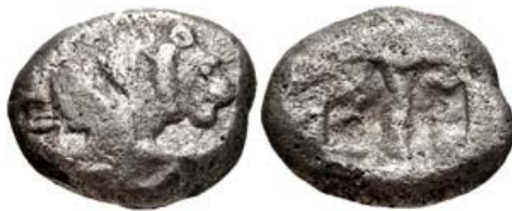
234, Lot: 87. Closing Jun 09, 2010 at 10:29:00 a.m. ET. CARIA, Mylasa. Circa 520-490 BC. AR Stater (20mm, 10.92 g).

BID Estimate $200 Current Bid: $120 Bidders (1)