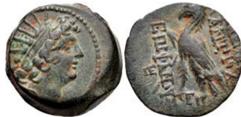
234, Lot: 120. Closing Jun 09, 2010 at 10:40:00 a.m. ET. SELEUKID KINGS of SYRIA. Antiochos VIII Epiphanes (Grypos). 121/0-97/6 BC. AE (18mm, 6.05 g, 1h). Antioch mint. Dated SE 195 (118/7 BC).

BID Estimate $200 Current Bid: $120 Bidders (1)