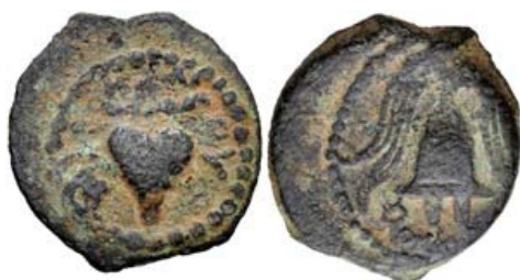
234, Lot: 129. Closing Jun 09, 2010 at 10:43:00 a.m. ET. JUDAEA, Herodians. Herod II Archelaus. 4 BCE-6 CE. AE Prutah (15mm, 2.27 g, 12h). Jerusalem mint.

BID Estimate $100 Current Bid: No Bids Bidders (0)