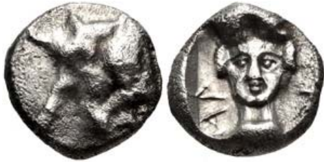
234, Lot: 93. Closing Jun 09, 2010 at 10:31:00 a.m. ET. CILICIA, Mallos. Circa 425-385 BC. AR Obol (8mm, 0.77 g, 5h).

BID Estimate $100 Current Bid: $60 Bidders (1)