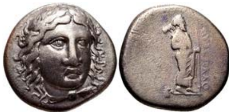
234, Lot: 89. Closing Jun 09, 2010 at 10:29:40 a.m. ET. SATRAPS of CARIA. Mausolos. Circa 377/6-353/2 BC. AR Drachm (15mm, 3.54 g, 1h).

BID Estimate $300 Current Bid: $185 Bidders (2)