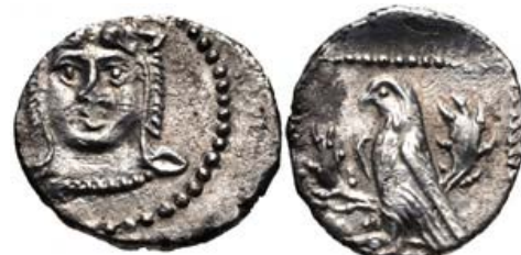
234, Lot: 110. Closing Jun 09, 2010 at 10:36:40 a.m. ET. CILICIA, Uncertain. 4th century BC. AR Obol (12mm, 0.63 g, 9h).

BID Estimate $100 Current Bid: $60 Bidders (1)