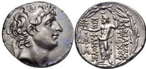
234, Lot: 123. Closing Jun 09, 2010 at 10:41:00 a.m. ET. SELEUKID KINGS of SYRIA. Antiochos VIII Epiphanes (Grypos). 121/0-97/6 BC. AR Tetradrachm (29mm, 16.45 g, 12h). Antioch mint. Struck circa 112-111/10 BC.

BID Estimate $200 Current Bid: $215 Bidders (4)