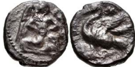
234, Lot: 96. Closing Jun 09, 2010 at 10:32:00 a.m. ET. CILICIA, Mallos. Circa 385-375 BC. AR Obol (9mm, 0.71 g, 6h).

BID Estimate $100 Current Bid: $72 Bidders (3)