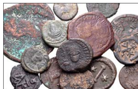
234, Lot: 613. Closing Jun 09, 2010 at 1:24:20 p.m. ET. BYZANTINE. Early. Lot of twenty-one (21) mixed A denominations.

BID Estimate $100 Current Bid: No Bids Bidders (0)