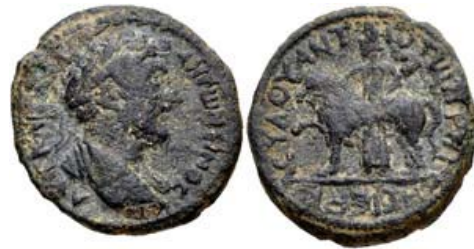
234, Lot: 168. Closing Jun 09, 2010 at 10:56:00 a.m. ET. SYRIA, Decapolis. Antiochia ad Hippum. Marcus Aurelius. AD 161-180. Æ (24mm, 10.25 g, 1h).

BID Estimate $300 Current Bid: No Bids Bidders (0)