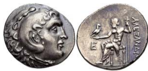
234, Lot: 90. Closing Jun 09, 2010 at 10:30:00 a.m. ET. LYCIA, Phaselis. AR Tetradrachm (29mm, 16.84 g, 12h). In the name and types of Alexander III. Dated CY 5 (214/3 BC).

BID Estimate $100 Current Bid: No Bids Bidders (0)