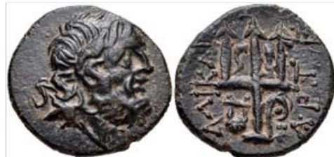
234, Lot: 86. Closing Jun 09, 2010 at 10:28:40 a.m. ET. CARIA, Halikarnassos. Circa 150-50 BC. Æ (19mm, 4.54 g, 11h).

BID Estimate $200 Current Bid: $120 Bidders (1)