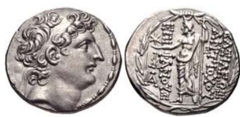
234, Lot: 122. Closing Jun 09, 2010 at 10:40:40 a.m. ET. SELEUKID KINGS of SYRIA. Antiochos VIII Epiphanes (Grypos). 121/0-97/6 BC. AR Tetradrachm (28mm, 16.61 g, 12h). Antioch mint. Struck circa 112-111/10 BC.

BID Estimate $300 Current Bid: $235 Bidders (4)