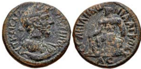
234, Lot: 167. Closing Jun 09, 2010 at 10:55:40 a.m. ET. SYRIA, Decapolis. Abila. Lucius Verus. AD 161-169. Æ (24mm, 111.50 g, 12h). Struck CY 230 (AD 166/7).

BID Estimate $100 Current Bid: No Bids Bidders (0)