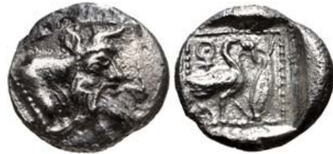
234, Lot: 94. Closing Jun 09, 2010 at 10:31:20 a.m. ET. CILICIA, Mallos. Early 4th century BC. AR Obol (10mm, 0.74 g, 6h).

BID Estimate $100 Current Bid: $60 Bidders (1)