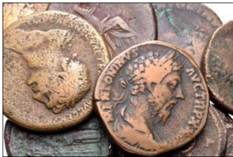
234, Lot: 608. Closing Jun 09, 2010 at 1:22:40 p.m. ET. ROMAN. Imperial. Lot of eleven (11) Sestertii of the 1st-3rd centuries.

BID Estimate $250 Current Bid: $310 Bidders (5)