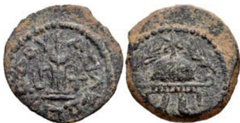
234, Lot: 127. Closing Jun 09, 2010 at 10:42:20 a.m. ET. JUDAEA, Herodians. Herod I (the Great). 40-4 BCE. AE 8 Prutot (22mm, 5.82 g, 1h). Samaria mint. Dated RY 3 (40 BCE).

BID Estimate $100 Current Bid: $105 Bidders (4)