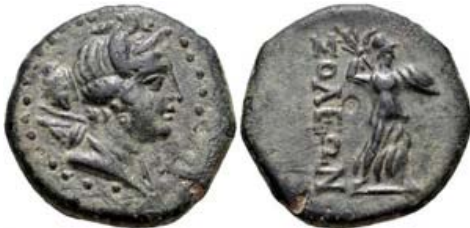
234, Lot: 99. Closing Jun 09, 2010 at 10:33:00 a.m. ET. CILICIA, Soloi. Circa 100-30 BC. AE (20mm, 5.65 g, 12h).

BID Estimate $100 Current Bid: $62 Bidders (2)