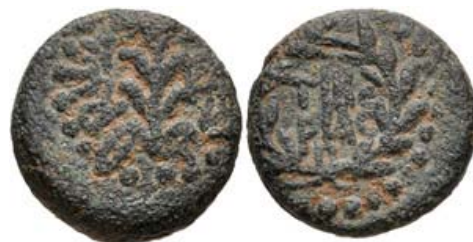
234, Lot: 130. Closing Jun 09, 2010 at 10:43:20 a.m. ET. JUDAEA, Herodians. Herod III Antipas. 4 BCE-39 CE. AE (14mm, 4.05 g, 11h). Tiberias mint. Dated RY 24 (19/20 CE).

BID Estimate $100 Current Bid: $60 Bidders (1)