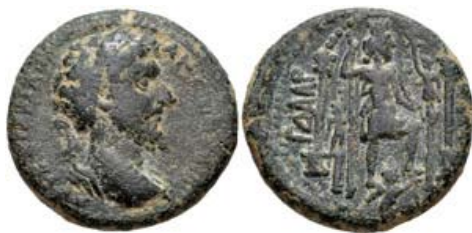
234, Lot: 171. Closing Jun 09, 2010 at 10:57:00 a.m. ET. SYRIA, Decapolis. Gadara. Marcus Aurelius. AD 161-180. Æ (23mm, 10.82 g, 12h). Dated CY 225 (AD 161/2).

BID Estimate $100 Current Bid: No Bids Bidders (0)