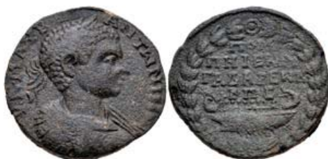
234, Lot: 173. Closing Jun 09, 2010 at 10:57:40 a.m. ET. SYRIA, Decapolis.

BID Estimate $100 Current Bid: No Bids Bidders (0)