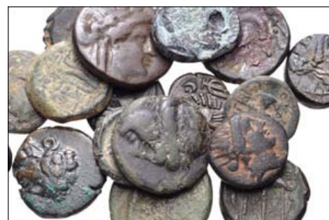
234, Lot: 615. Closing Jun 09, 2010 at 1:25:00 p.m. ET. MIXED. Celtic-Oriental Greek. Lot of twenty-six (26) mostly Greek A denominations.

BID Estimate $200 Current Bid: No Bids Bidders (0)