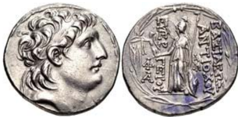
234, Lot: 119. Closing Jun 09, 2010 at 10:39:40 a.m. ET. SELEUKID KINGS of SYRIA. Antiochos VII Euergetes (Sidetes). 138-129 BC. AR Tetradrachm (28mm, 16.70 g, 12h). Antioch mint.

BID Estimate $150 Current Bid: No Bids Bidders (0)