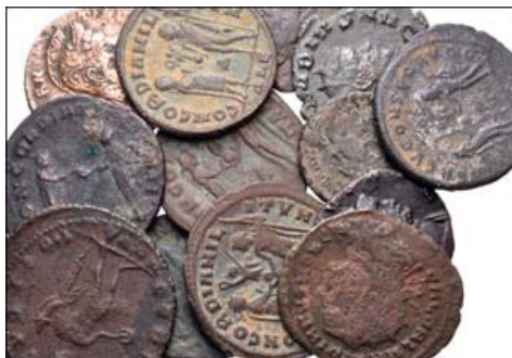
234, Lot: 610. Closing Jun 09, 2010 at 1:23:20 p.m. ET. ROMAN. Imperial. Lot of twenty-four (24) A denominations of the 3rd-4th centuries.

BID Estimate $250 Current Bid: $165 Bidders (3)