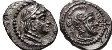
234, Lot: 102. Closing Jun 09, 2010 at 10:34:00 a.m. ET. CILICIA, Tarsos. Tarkumuwa (Datames). Satrap of Cilicia and Cappadocia, 384-361/0 BC. AR Obol (0mm, 0.72 g, 3h).

BID Estimate $75 Current Bid: $45 Bidders (1)