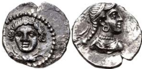
234, Lot: 103. Closing Jun 09, 2010 at 10:34:20 a.m. ET. CILICIA, Tarsos. Time of Pharnabazos and Datames. Circa 380-361/0 BC. AR Obol (10mm, 0.74 g, 6h).

BID Estimate $100 Current Bid: $78 Bidders (3)