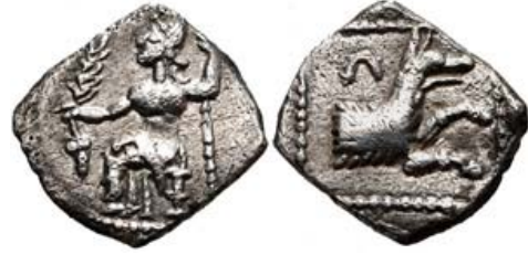
234, Lot: 116. Closing Jun 09, 2010 at 10:38:40 a.m. ET. CILICIA, Uncertain. 4th century BC. AR Obol (11mm, 0.53 g, 12h).

BID Estimate $100 Current Bid: $88 Bidders (3)