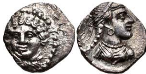
234, Lot: 104. Closing Jun 09, 2010 at 10:34:40 a.m. ET. CILICIA, Tarsos. Time of Pharnabazos and Datames. Circa 380-361/0 BC. AR Obol (10mm, 0.61 g, 6h).

BID Estimate $100 Current Bid: $78 Bidders (3)