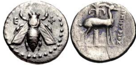
234, Lot: 84. Closing Jun 09, 2010 at 10:28:00 a.m. ET. IONIA, Ephesos. Circa 202-150 BC. AR Drachm (18mm, 3.73 g, 12h). Demetrios, magistrate.

BID Estimate $150 Current Bid: $140 Bidders (5)