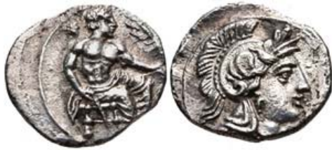
234, Lot: 113. Closing Jun 09, 2010 at 10:37:40 a.m. ET. CILICIA, Uncertain. 4th century BC. AR Obol (10mm, 0.62 g, 6h).

BID Estimate $100 Current Bid: $60 Bidders (1)