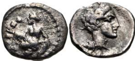
234, Lot: 101. Closing Jun 09, 2010 at 10:33:40 a.m. ET. CILICIA, Tarsos. Circa 389-375 BC. AR Hemiobol (10mm, 0.40 g, 12h).

BID Estimate $100 Current Bid: No Bids Bidders (0)