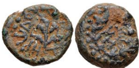
234, Lot: 131. Closing Jun 09, 2010 at 10:43:40 a.m. ET. JUDAEA, Herodians.

BID Estimate $100 Current Bid: $125 Bidders (5)