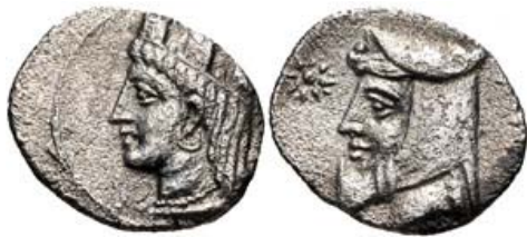
234, Lot: 117. Closing Jun 09, 2010 at 10:39:00 a.m. ET. CILICIA(?), Uncertain. 4th century BC. AR Obol (12mm, 0.68 g, 4h).

BID Estimate $100 Current Bid: $64 Bidders (3)