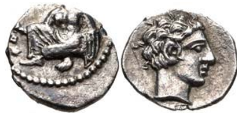
234, Lot: 100. Closing Jun 09, 2010 at 10:33:20 a.m. ET. CILICIA, Tarsos. Circa 389-375 BC. AR Hemiobol (9mm, 0.45 g, 4h).

BID Estimate $100 Current Bid: $62 Bidders (2)