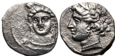
234, Lot: 109. Closing Jun 09, 2010 at 10:36:20 a.m. ET. CILICIA, Uncertain. 4th century BC. AR Obol (10mm, 0.67 g, 9h).

BID Estimate $100 Current Bid: $88 Bidders (2)