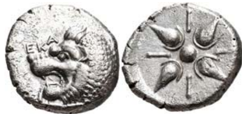
234, Lot: 88. Closing Jun 09, 2010 at 10:29:20 a.m. ET. SATRAPS of CARIA. Hekatomnos. Circa 392/1-377/6 BC. AR Drachm (16mm, 4.14 g).

BID Estimate $150 Current Bid: $94 Bidders (2)