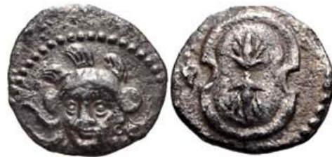
234, Lot: 108. Closing Jun 09, 2010 at 10:36:00 a.m. ET. CILICIA, Uncertain. 4th century BC. AR Obol (11mm, 0.58 g, 5h).

BID Estimate $100 Current Bid: $60 Bidders (1)