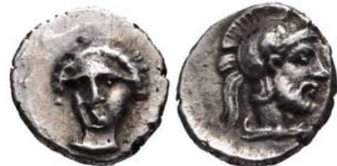
234, Lot: 106. Closing Jun 09, 2010 at 10:35:20 a.m. ET. CILICIA, Tarsos. Time of Pharnabazos and Datames. Circa 380-361/0 BC. AR Hemiobol (7mm, 0.31 g, 6h).

BID Estimate $100 Current Bid: No Bids Bidders (0)