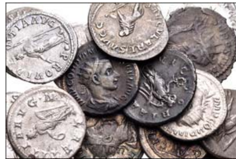
234, Lot: 609. Closing Jun 09, 2010 at 1:23:00 p.m. ET. ROMAN. Imperial. Lot of eighteen (18) Antoniniani of the 3rd century.

BID Estimate $250 Current Bid: $310 Bidders (5)