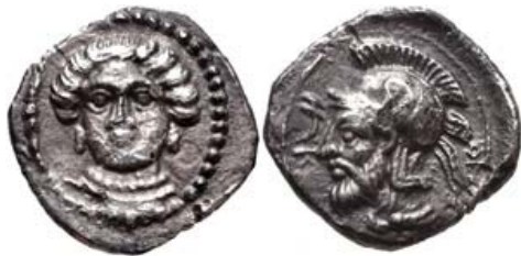
234, Lot: 105. Closing Jun 09, 2010 at 10:35:00 a.m. ET. CILICIA, Tarsos. Time of Pharnabazos and Datames. Circa 380-361/0 BC. AR Obol (10mm, 0.72 g, 3h).

BID Estimate $100 Current Bid: No Bids Bidders (0)