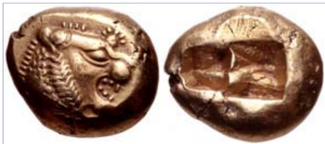
234, Lot: 85. Closing Jun 09, 2010 at 10:28:20 a.m. ET. KINGS of LYDIA. Alyattes to Kroisos. Circa 610-546 BC. EL Trite – 1/3 Stater (13mm, 4.74 g). Sardes mint.

BID Estimate $1500 Current Bid: $1900 Bidders (8)