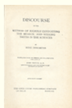
Title Page Image