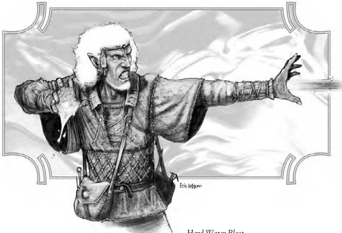
Hard Water Blast

You create a discordant sound making it difficult for anyone in the area to cast spells and concentrate on what they are doing. This spell affects everyone in the area, friend or foe, unless they succeed at a Will save. You must make a Perform check to complete the spell, the result of this skill check effects how easy or difficult it is for affected spell casters to complete a spell. Spell casters must make a successful Concentration check (DC = your Perform check + spell level) to complete a spell. All effected in the area suffer a -2 penalty to attack rolls, saving throws,