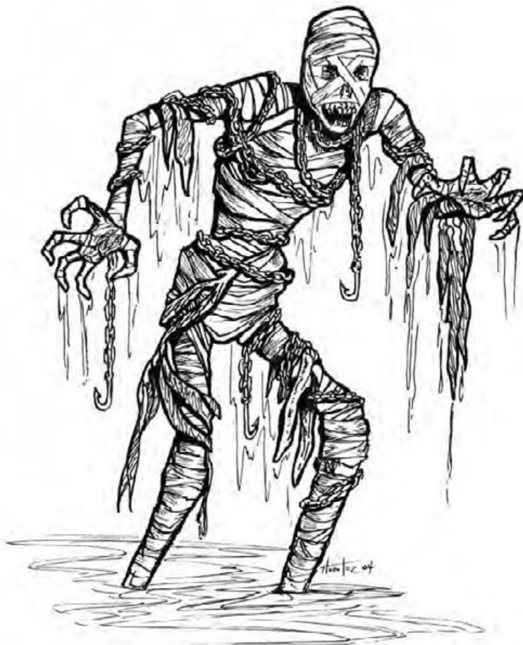
Summon Undead IV