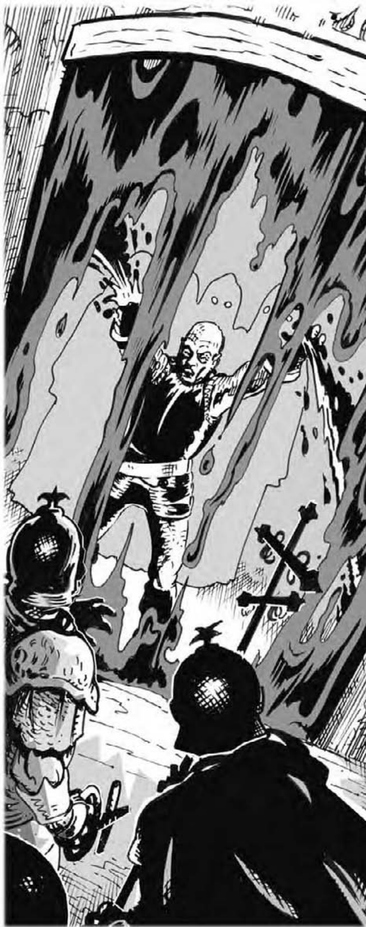
Wall of Blood