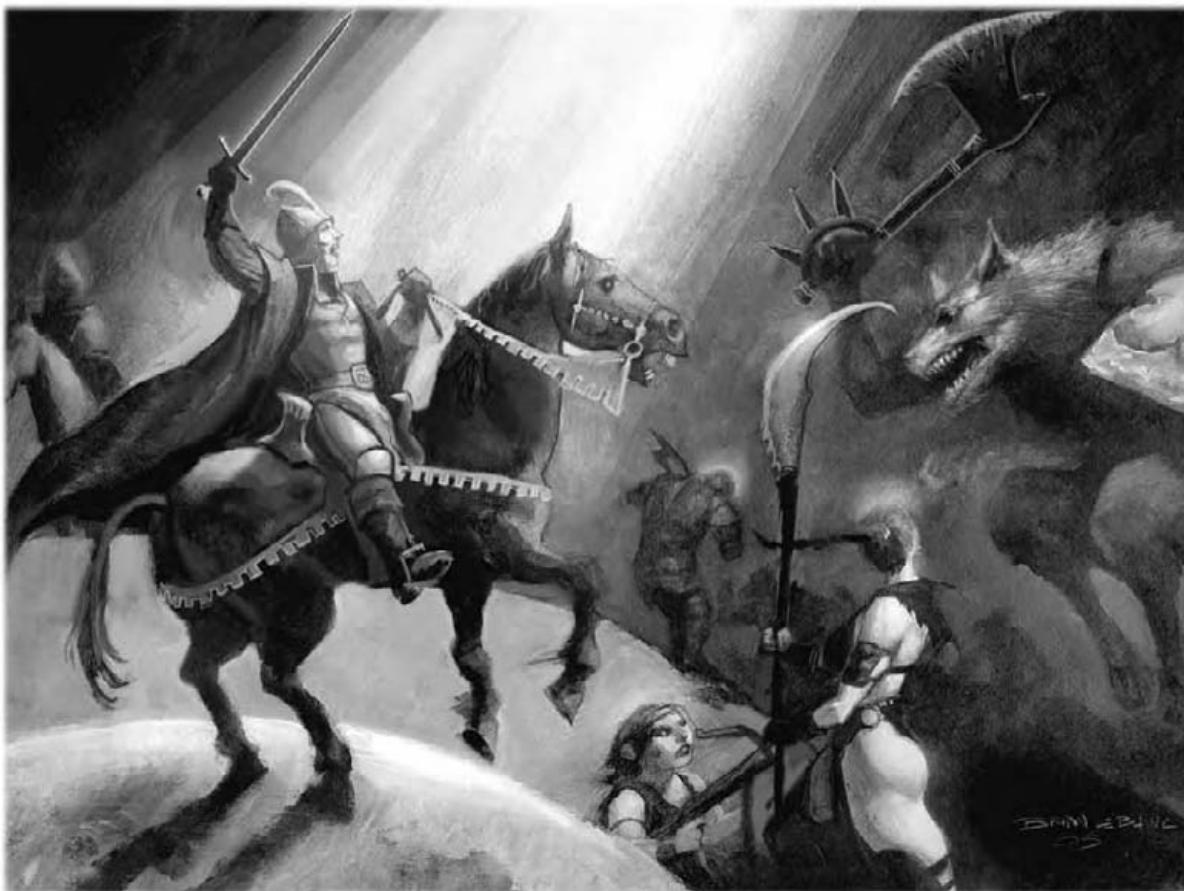
Paean of the Holy

The caster must choose one, and only one, of the above and a paean of the holy can only be cast once per day. These songs of