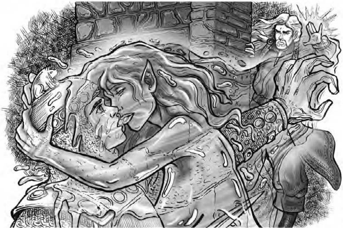
Kiss of the Nereid

Area: Cone Duration: 5 minutes/level Saving Throw: None Spell Resistance: No