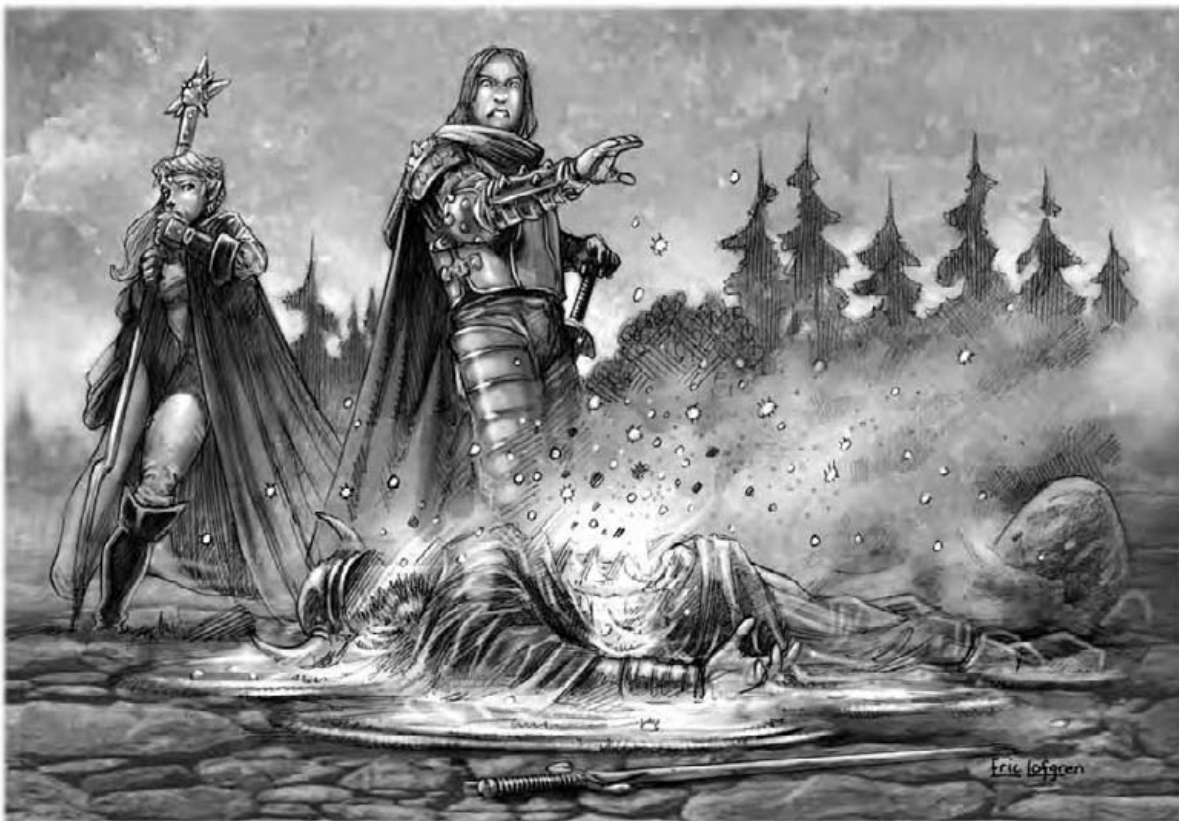
Rot to the Core

Material Component: Pumpkin seeds and a bit of mold.