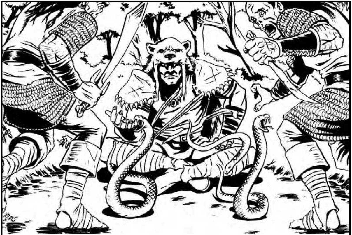
Snakes to Sticks

You call up a billowing cloud of superheated air that rolls across the ground toward an enemy. The steam cloud deals 1d4 points of damage per caster level (10d4 maximum) to creatures that remain in the cloudbank. Anyone within the cloudbank is also treated as if they are within a fog cloud.