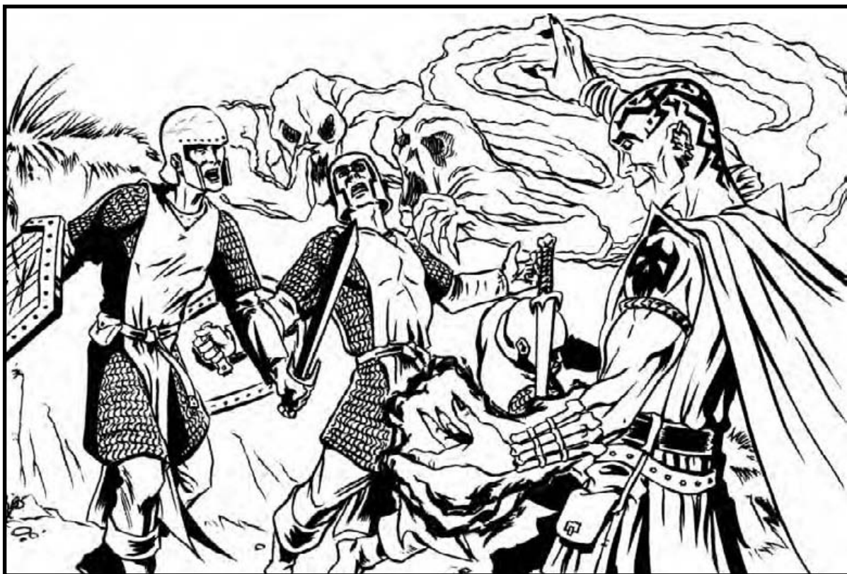
Zephyr of Death