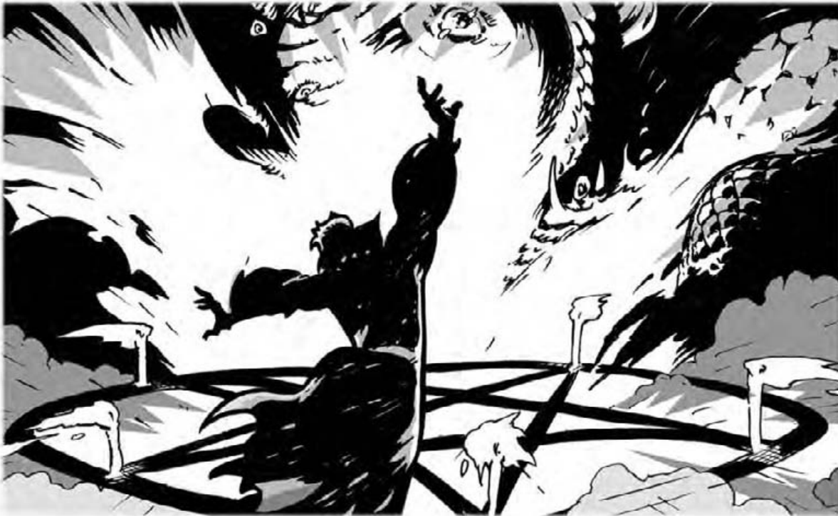
Summon Lesser Demon